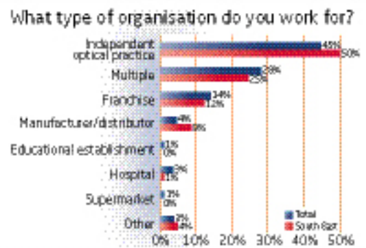
Figure 2 What type of organisation do you work for?