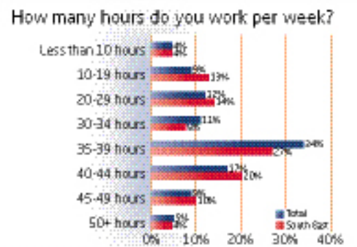
Figure 4 On average how many hours do you work per week? (excluding lunch breaks)