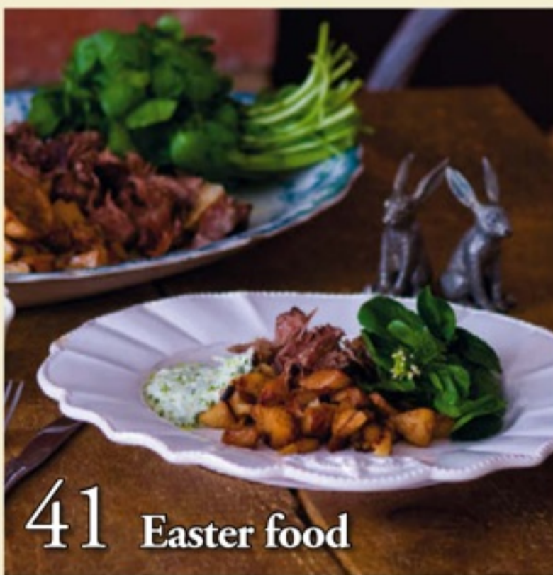
41 Easter food