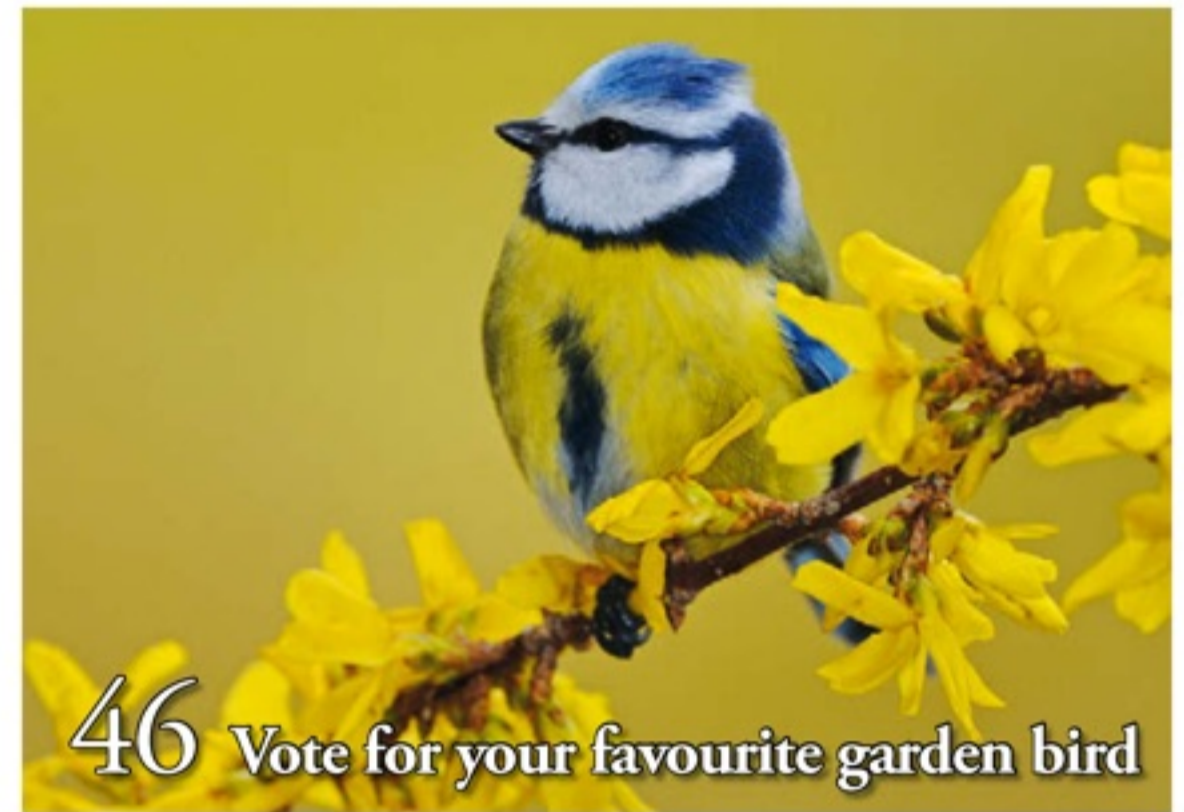
46 Vote for your favourite garden bird