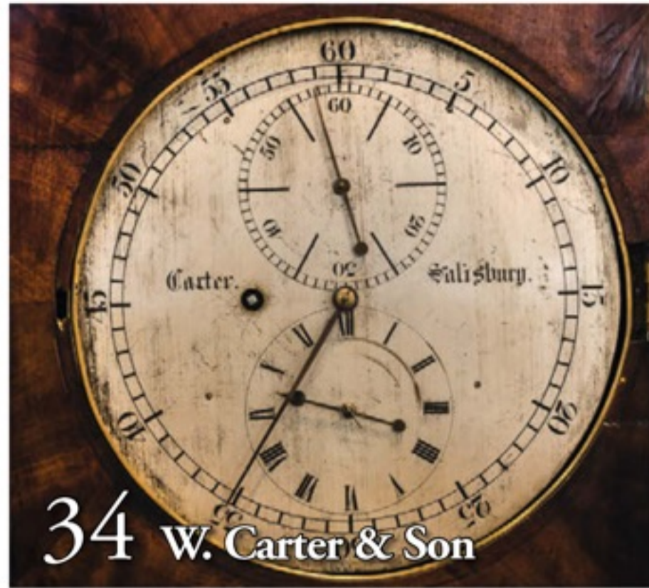
34 W. Carter & Son