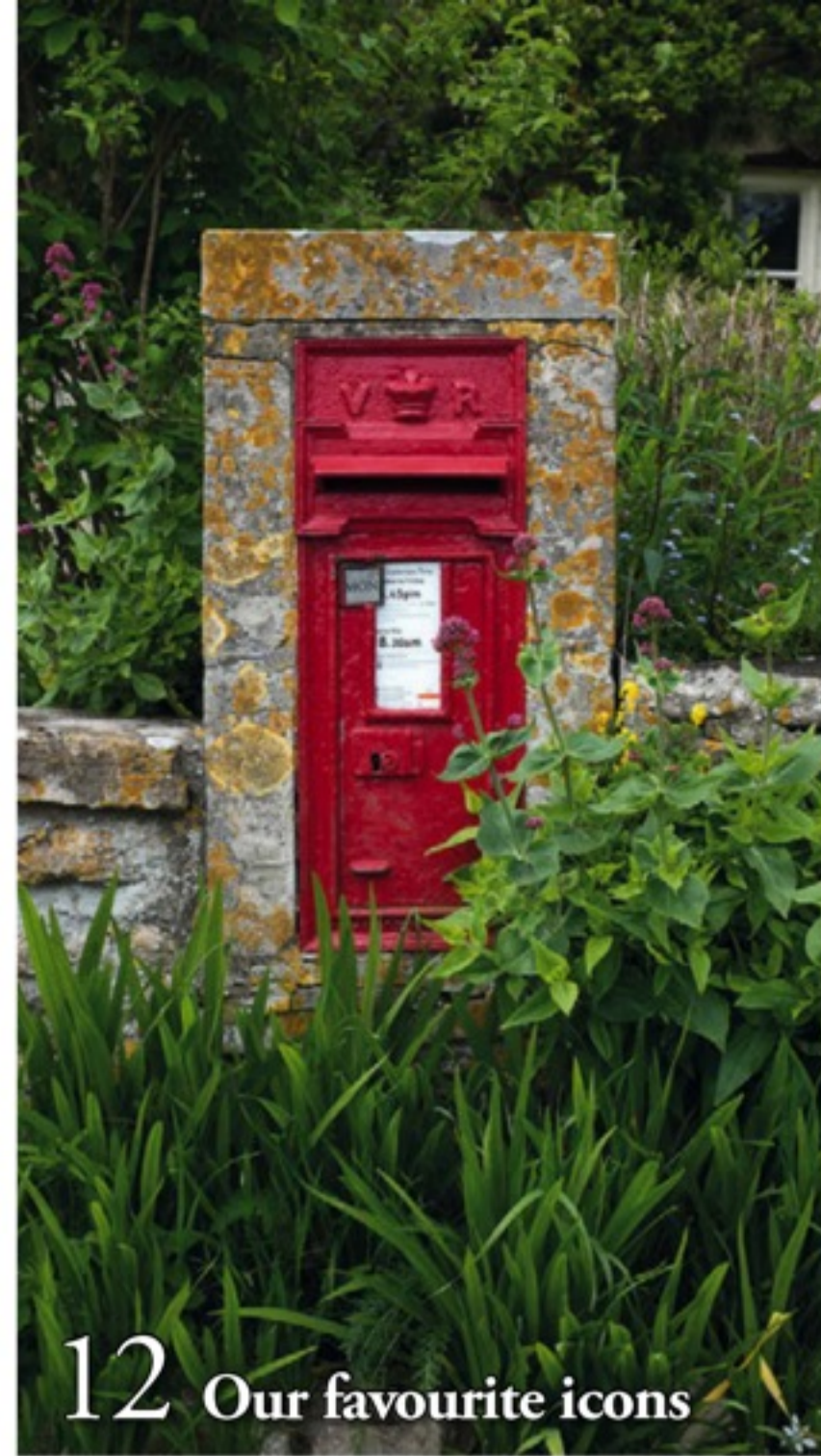
12 Our favourite icons