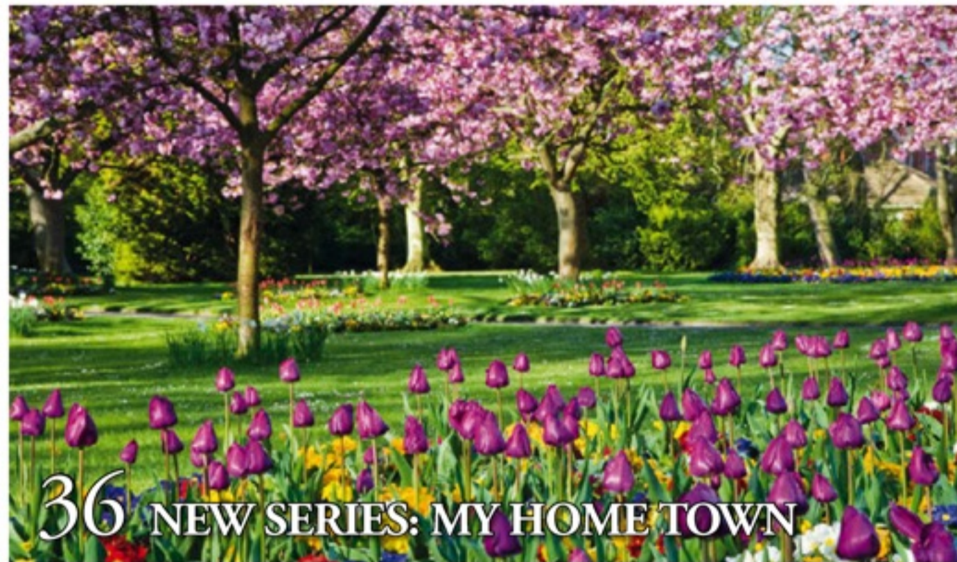
36 NEW SERIES: MY HOME TOWN