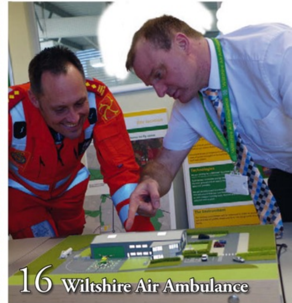
16 Wiltshire Air Ambulance