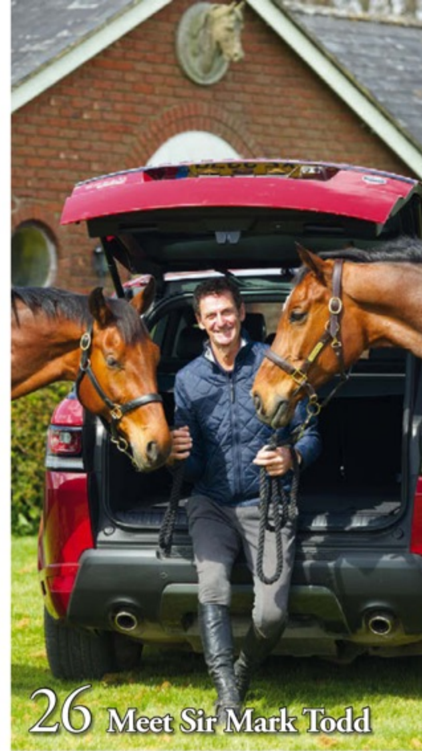
26 Meet Sir Mark Todd