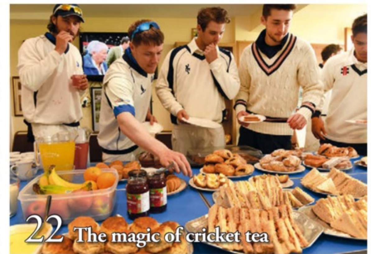
22 The magic of cricket tea