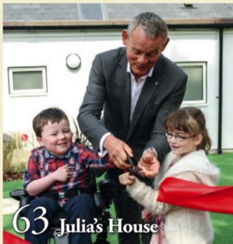
63 Julia's House