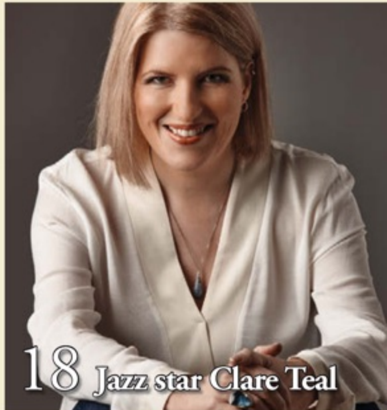
18 Jazz star Clare Teal