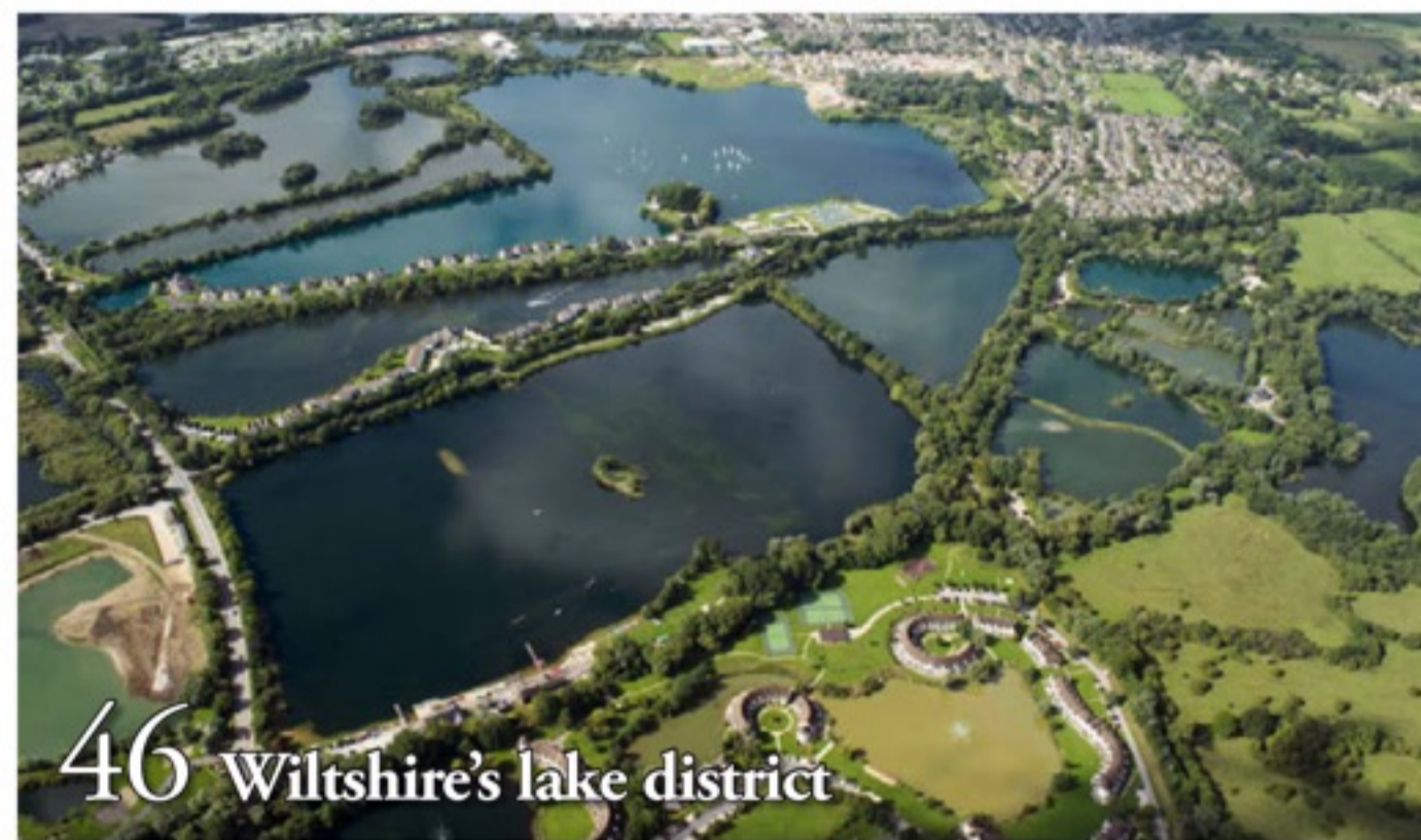
46 Wiltshire's lake district