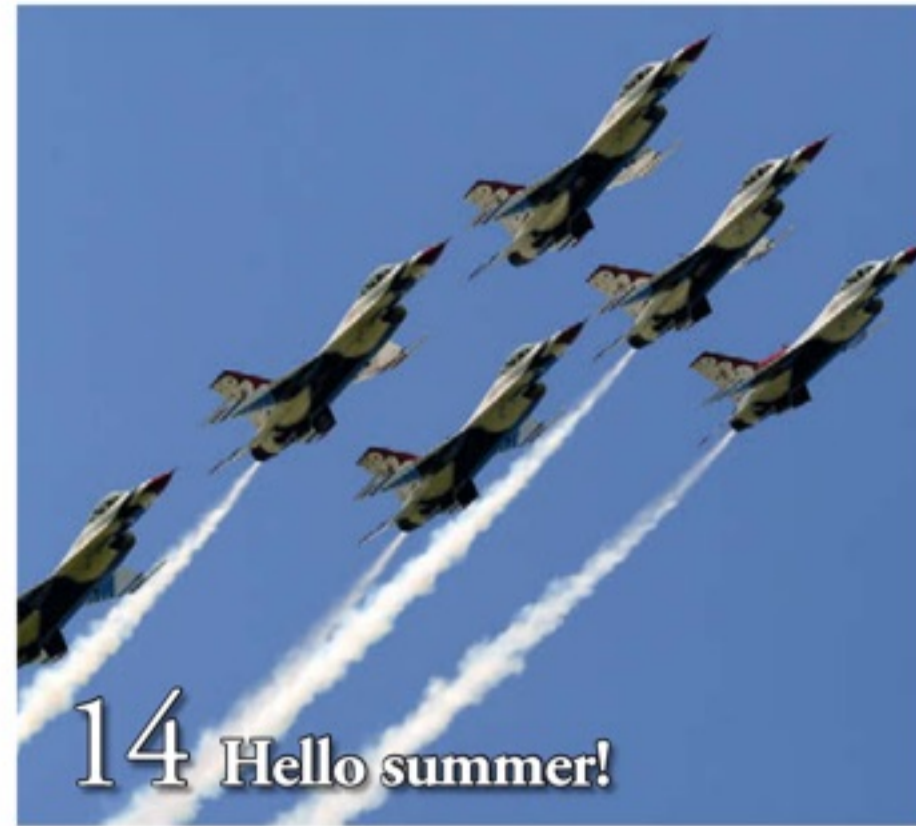
14 Hello summer!