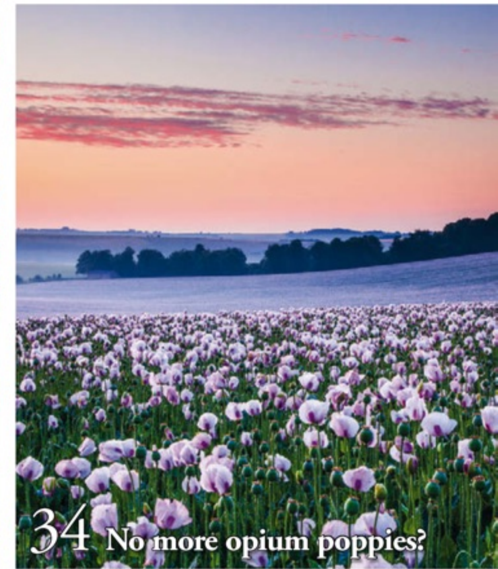
34 No more opium poppies?