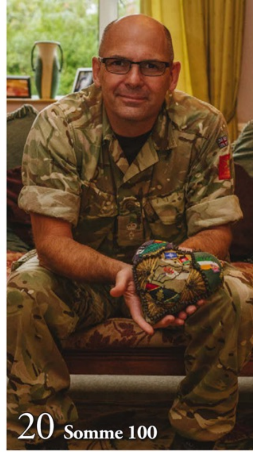
20 Somme 100