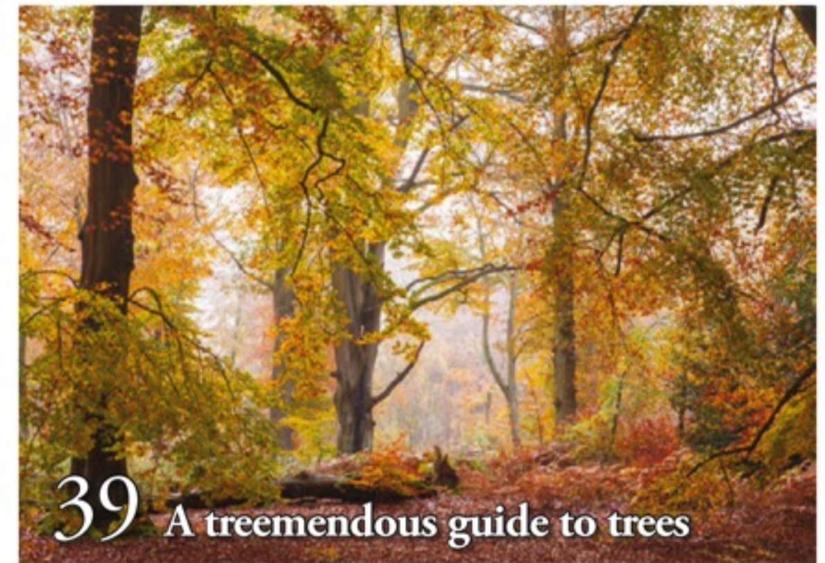
39 A tremendous guide to trees