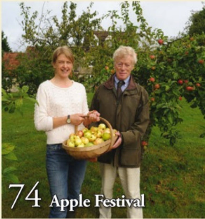
74 Apple Festival