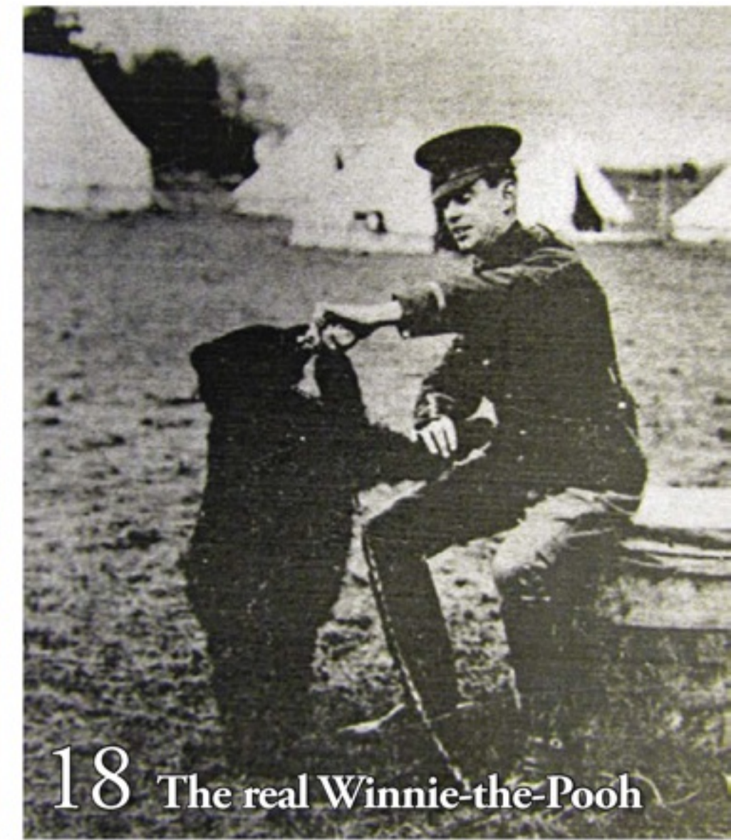
18 The real Winnie-the-Pooh