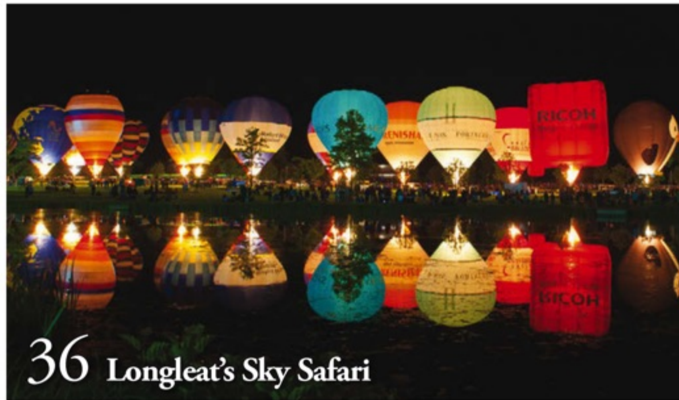
36 Longleat's Sky Safari