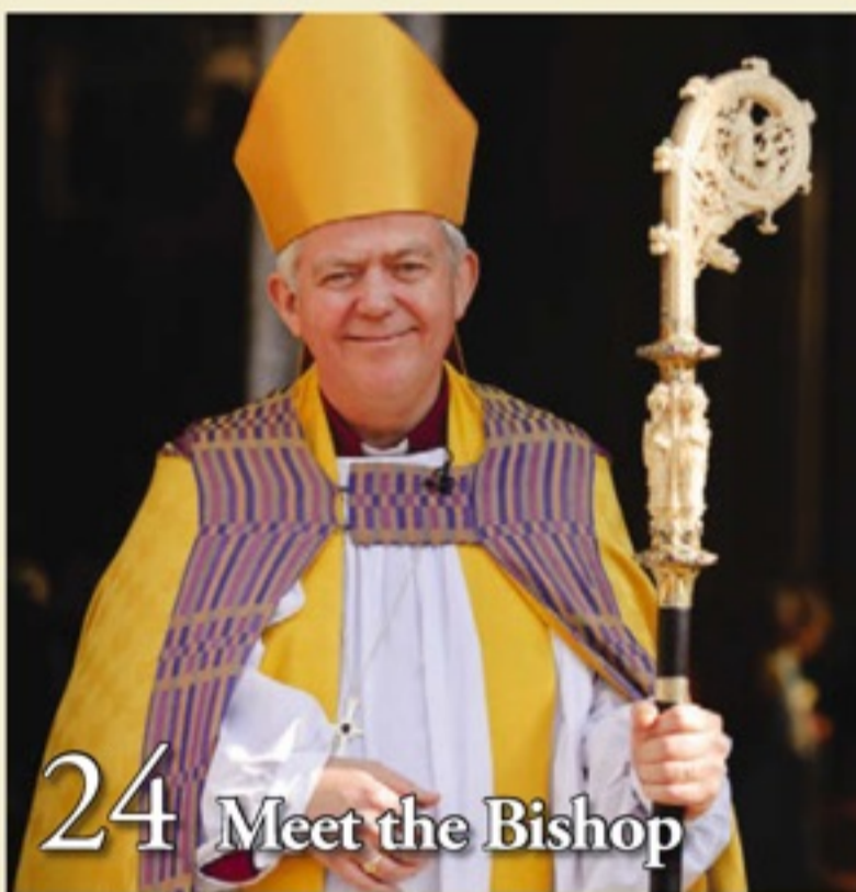
24 Meet the Bishop