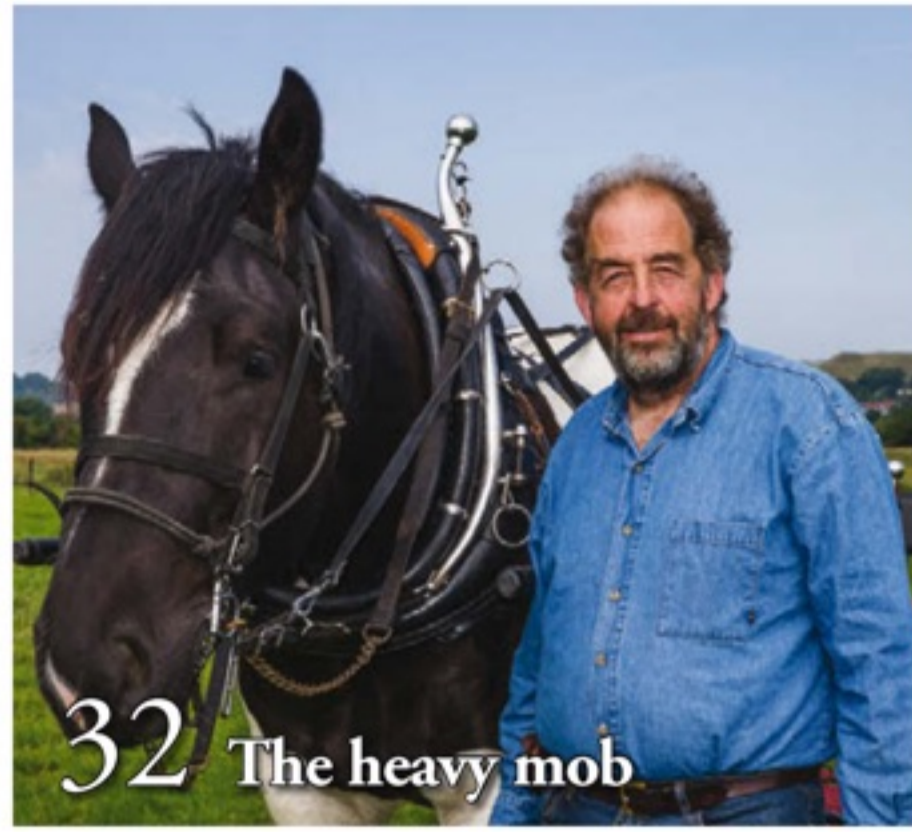
32 The heavy mob