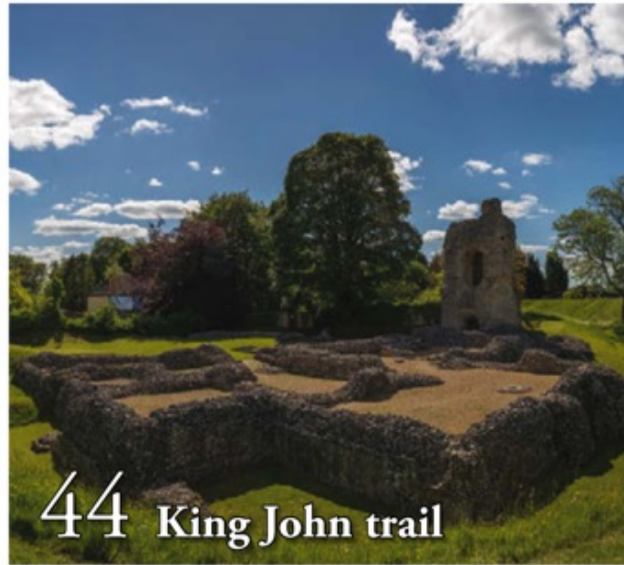
44 King John trail