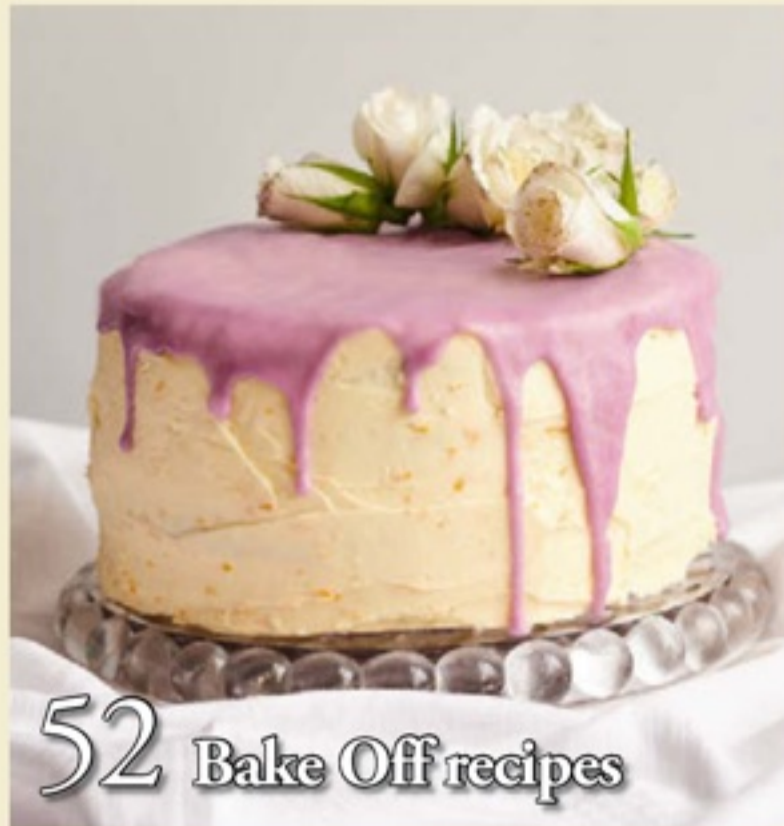
52 Bake Off recipes