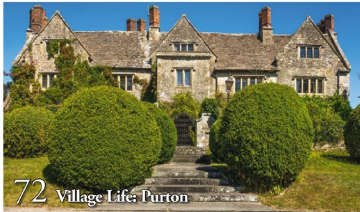
72 Village Life: Purton