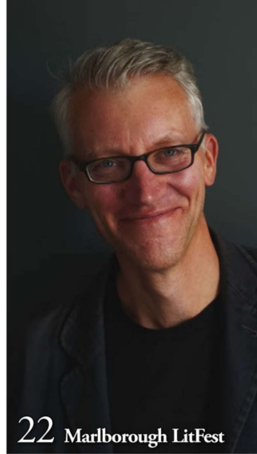
22 Marlborough LitFest