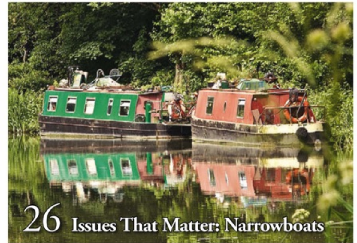
26 Issues That Matter: Narrowboats