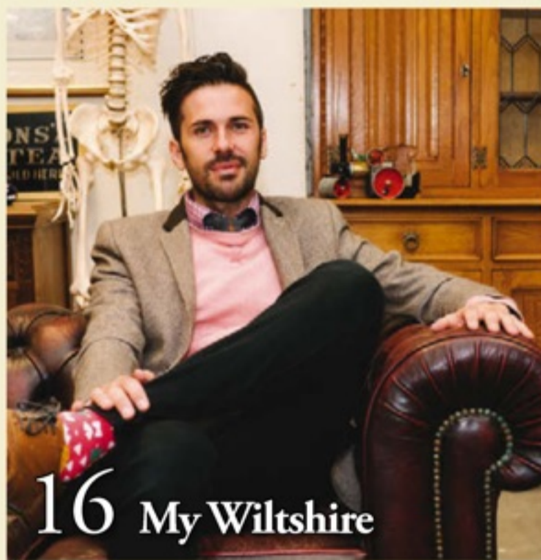
16 My Wiltshire