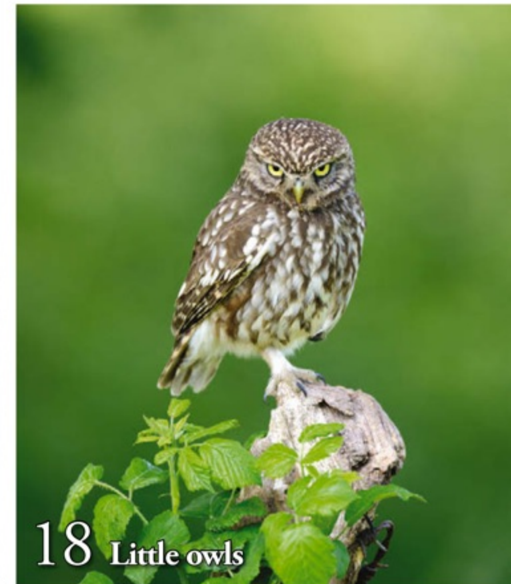
18 Little owls