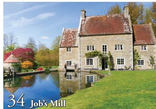
34 Job's Mill