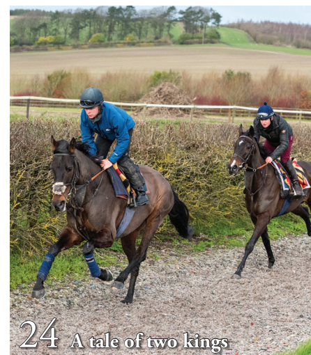
24 A tale of two kings