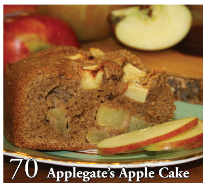
70 Applegate's Apple Cake