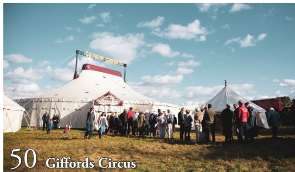
50 Giffords Circus