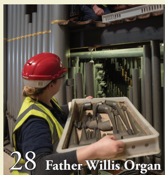
28 Father Willis Organ