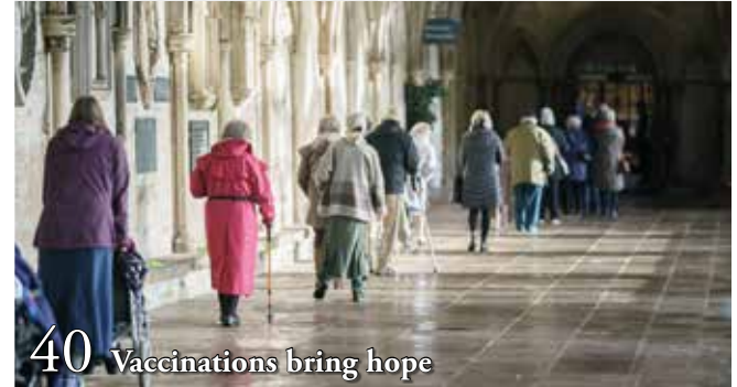
40 Vaccinations bring hope