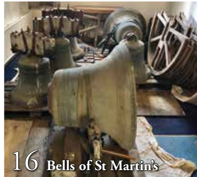
16 Bells of St Martin's