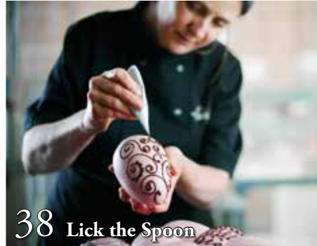
38 Lick the Spoon