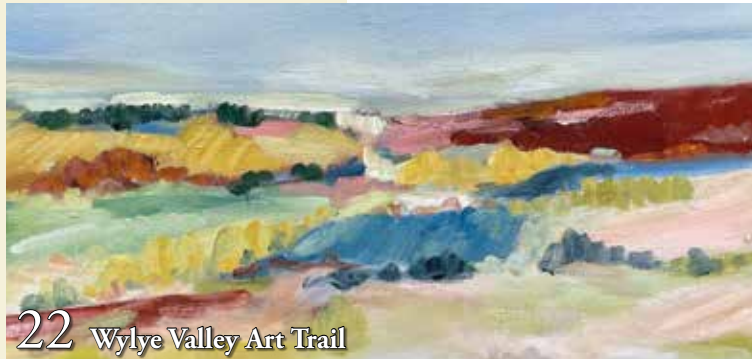
22 Wylve Valley Art Trail