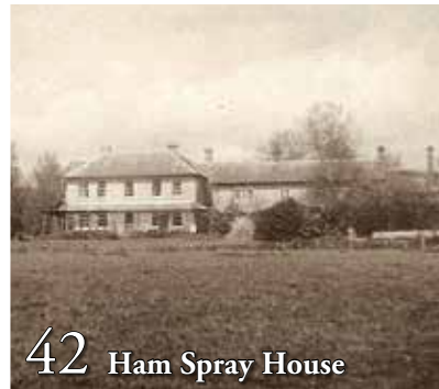
42 Ham Spray House