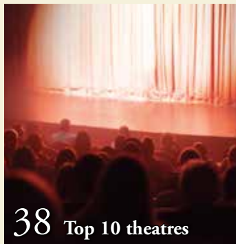
38 Top 10 theatres