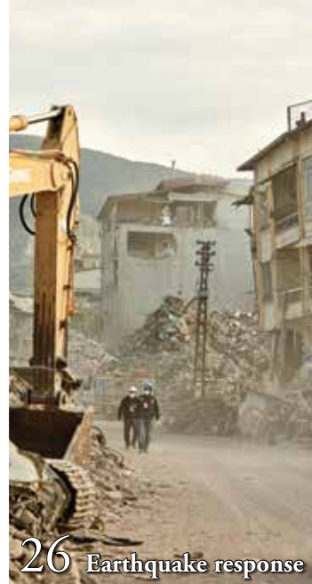
26 Earthquake response