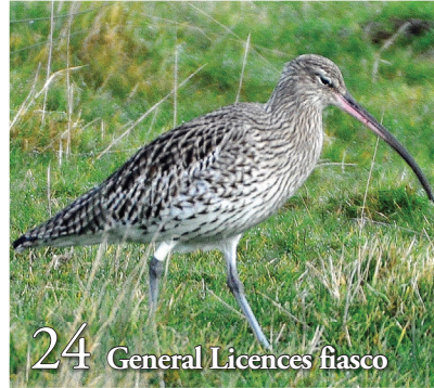
24 General Licences fiasco