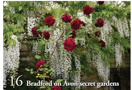
16 Bradford on Avon secret gardens