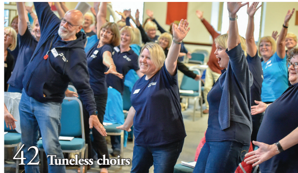
42 Tuneless choirs