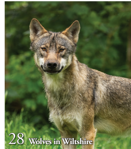
28 Wolves in Wiltshire