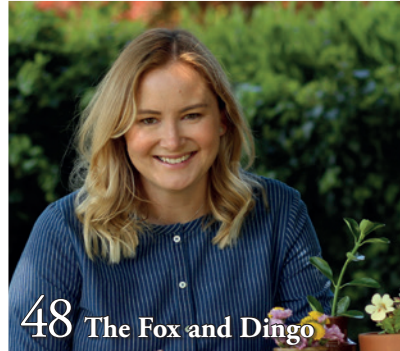
48 The Fox and Dingo