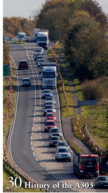
30 History of the A303