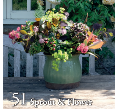
51 Sprout & Flower