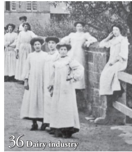
36 Dairy industry