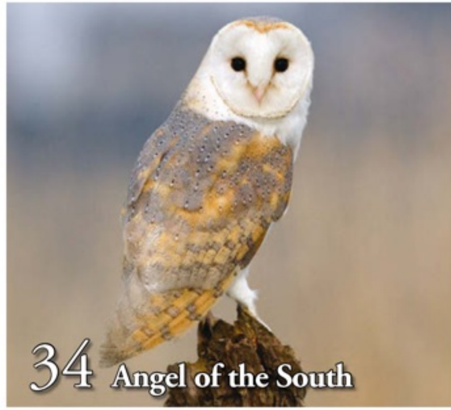
34 Angel of the South