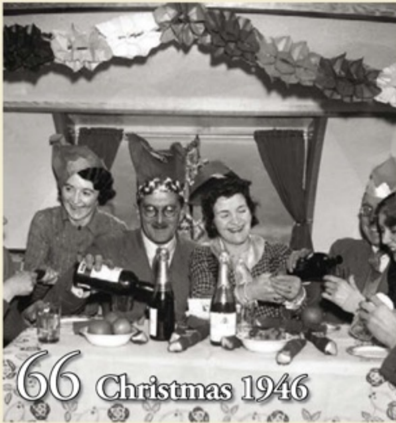
66 Christmas 1946