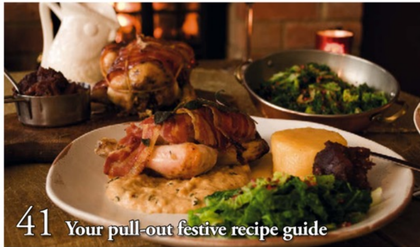
41 Your pull-out festive recipe guide