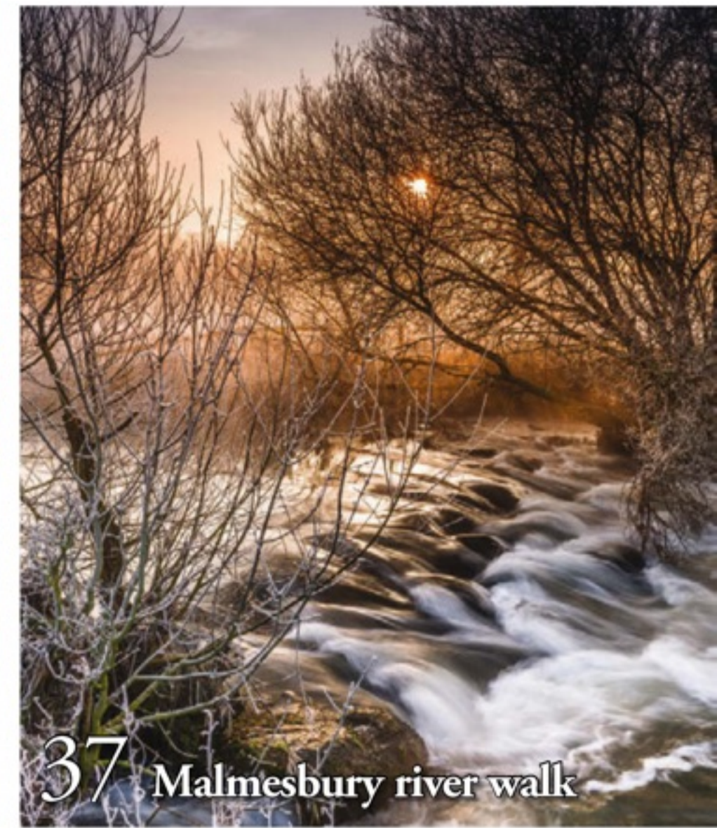
37 Malmesbury river walk