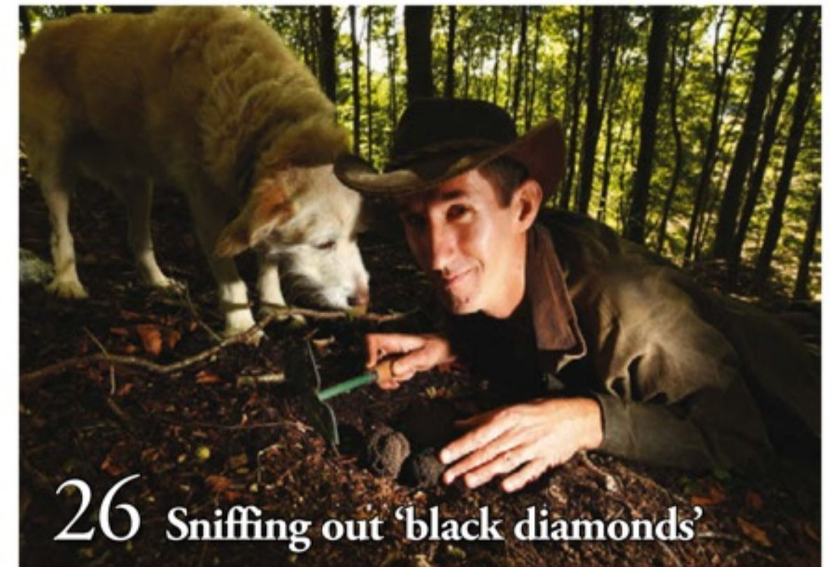
26 Sniffing out 'black diamonds'