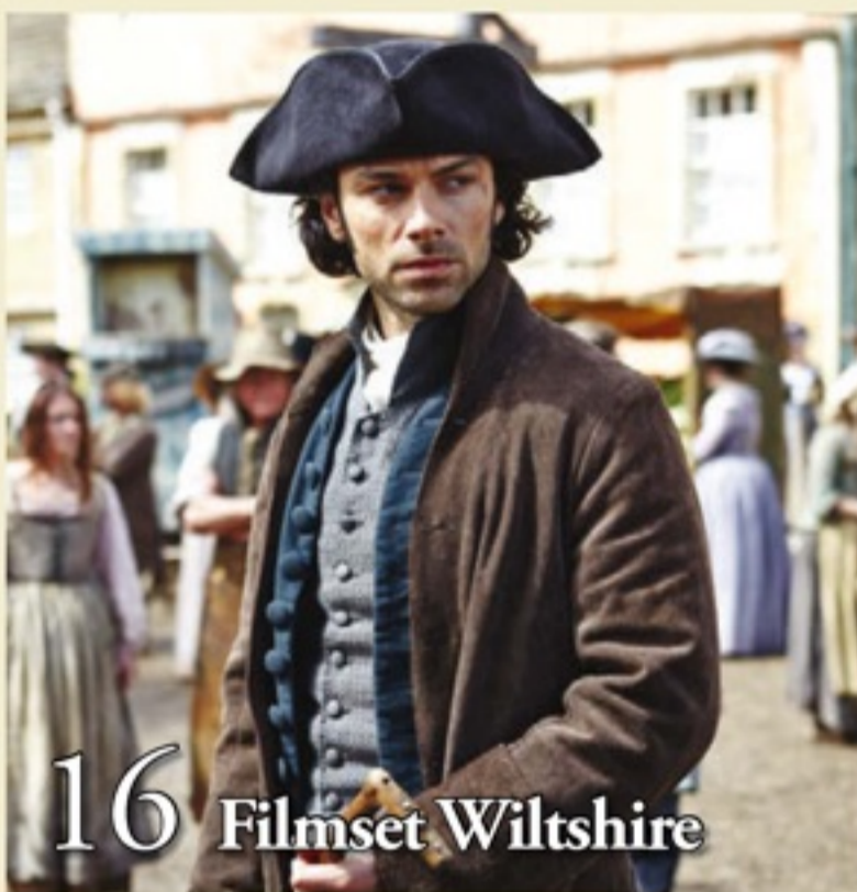
16 Filmset Wiltshire