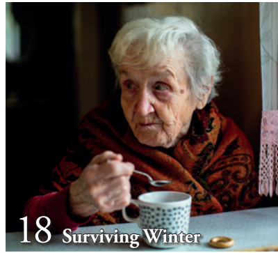
18 Surviving Winter