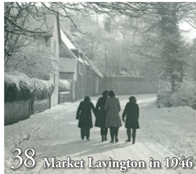
38 Market Lavington in 1946