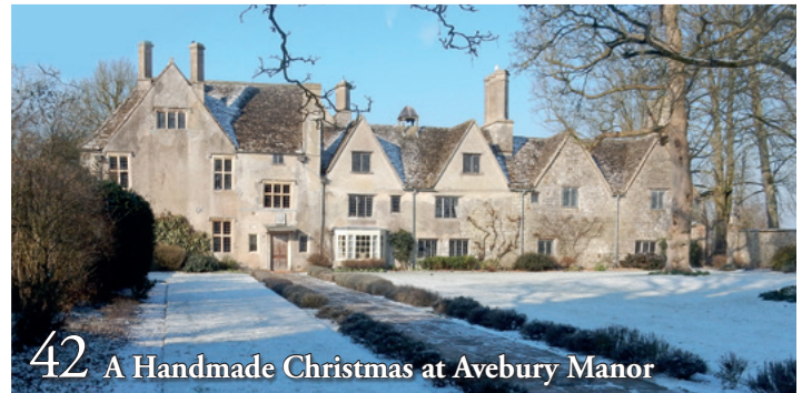
42 A Handmade Christmas at Avebury Manor