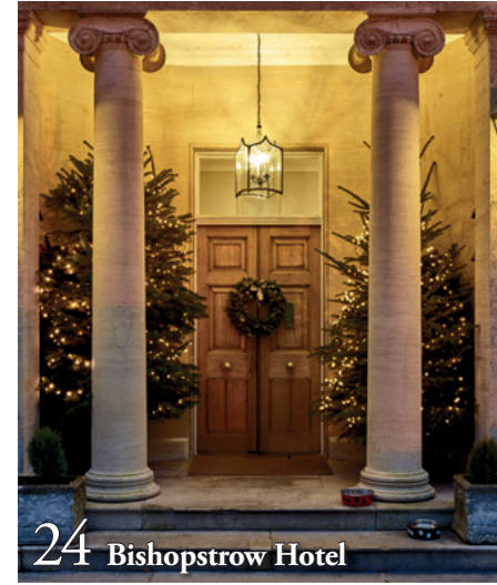
24 Bishopstrow Hotel