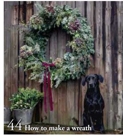
44 How to make a wreath