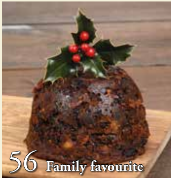
56 Family favourite