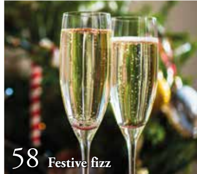
58 Festive fizz