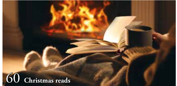
60 Christmas reads