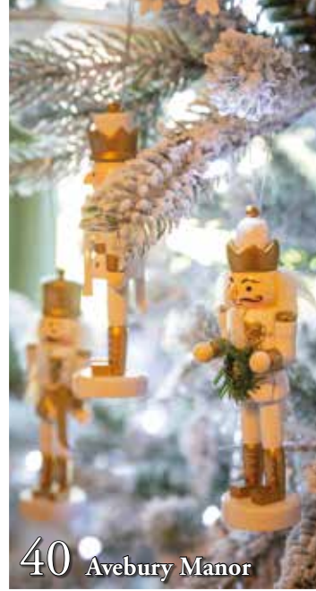
40 Avebury Manor