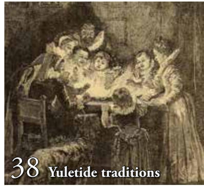
38 Yuletide traditions