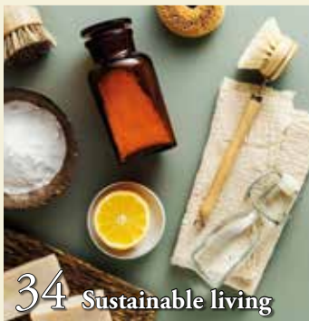
34 Sustainable living