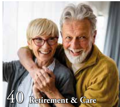
40 Retirement & Care