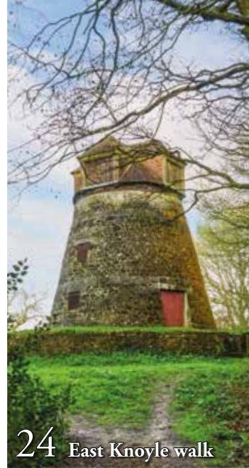
24 East Knoyle walk