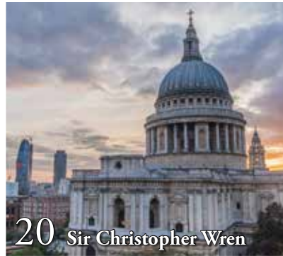
20 Sir Christopher Wren