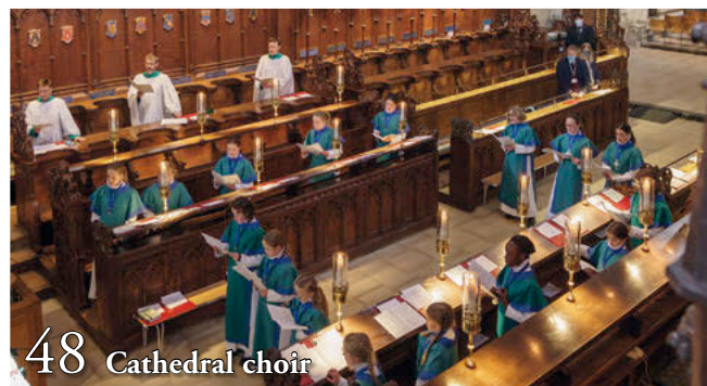
48 Cathedral choir