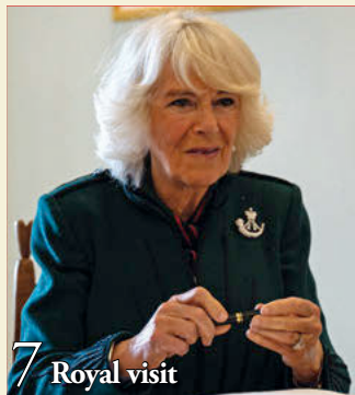
7 Royal visit