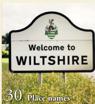
30 Place names