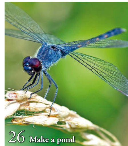
26 Make a pond