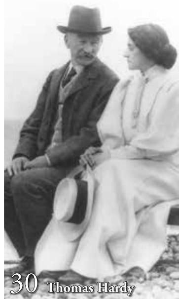
30 Thomas Hardy