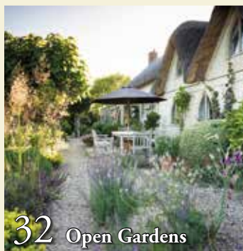
32 Open Gardens