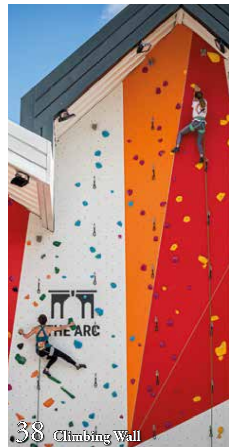
38 Climbing Wall