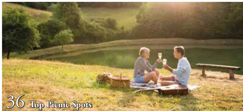
36 Top Picnic Spots