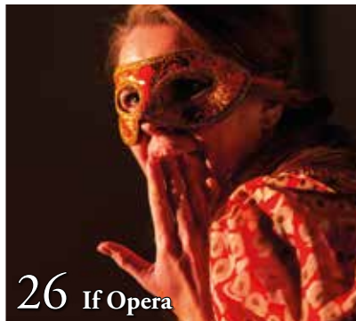
26 If Opera