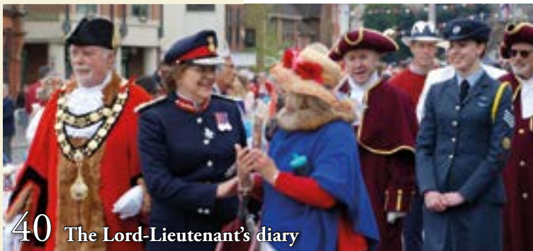
40 The Lord-Lieutenant's diary