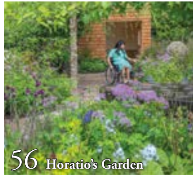
56 Horatio's Garden