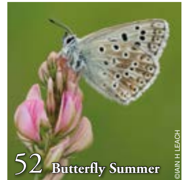
52 Butterfly Summer