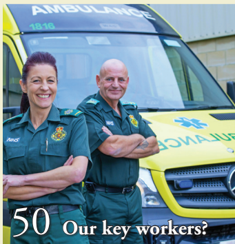
50 Our key workers?