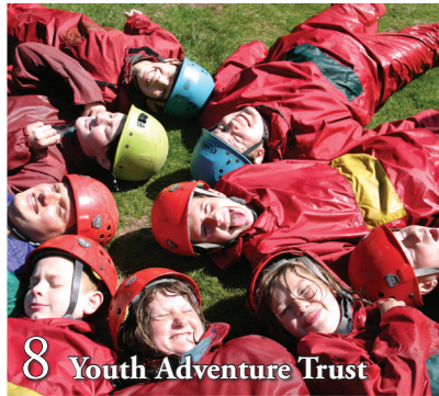
8 Youth Adventure Trust