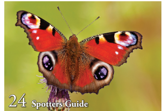
24 Spotters Guide