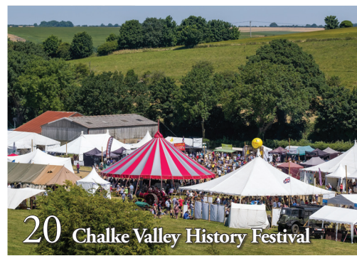
20 Chalke Valley History Festival