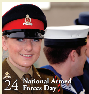
24 National Forces Day