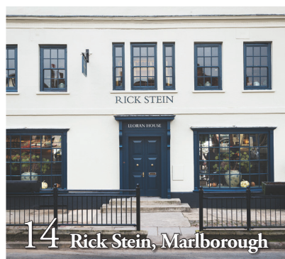
14 Rick Stein, Marlborough