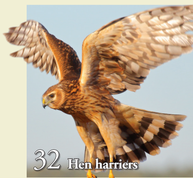
32 Hen harriers