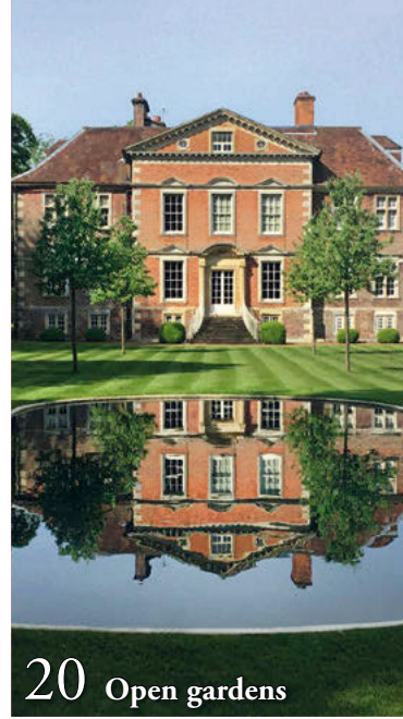
20 Open gardens