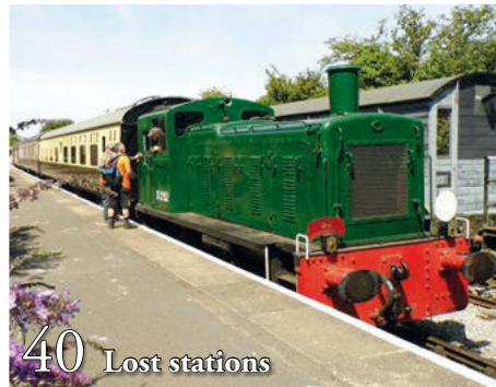
40 Lost stations