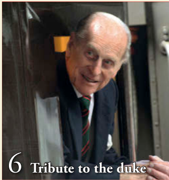
6 Tribute to the duke