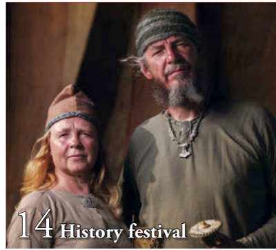
14 History festival