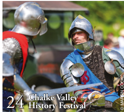
24 Chalke Valley History Festival