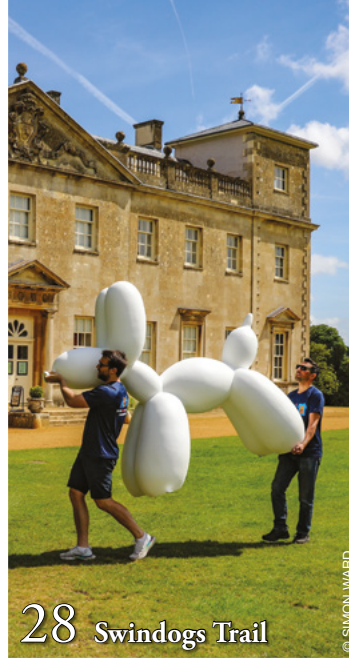
28 Swindogs Trail