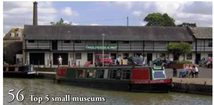
56 Top 5 small museums