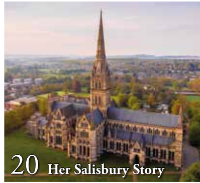
20 Her Salisbury Story