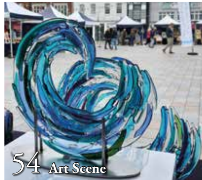
54 Art Scene