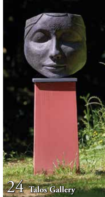
24 Talos Gallery