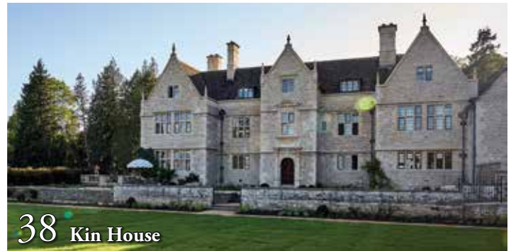
38 Kin House