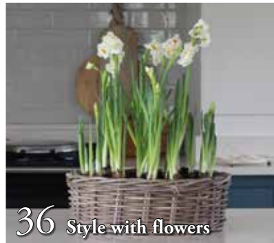
36 Style with flowers