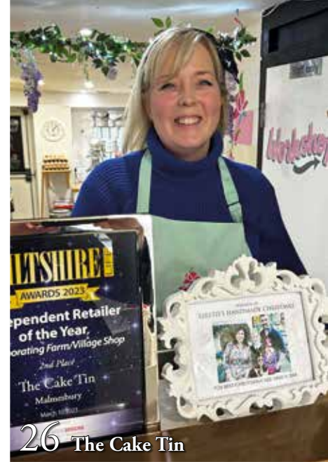
26 The Cake Tin