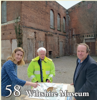
58 Wiltshire Museum