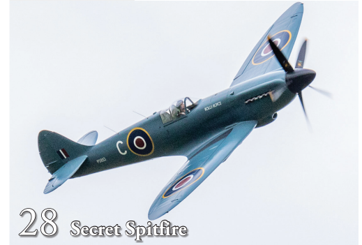
28 Secret Spitfire