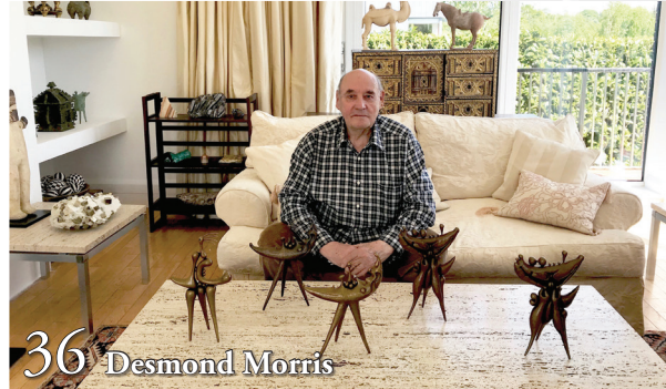
36 Desmond Morris