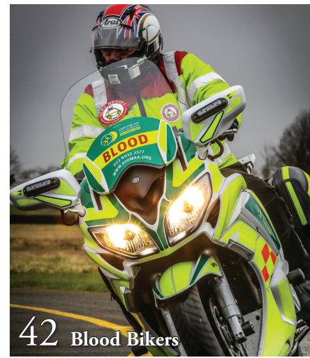
42 Blood Bikers