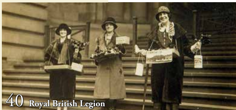
40 Royal British Legion