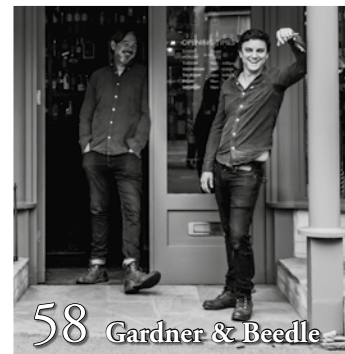
58 Gardner & Beedle