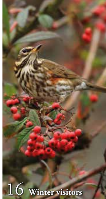
16 Winter visitors