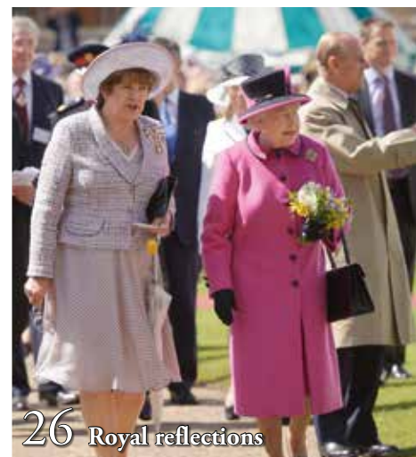
26 Royal reflections