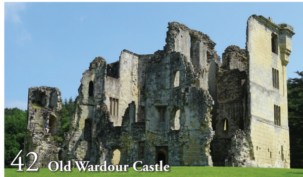
42 Old Wardour Castle