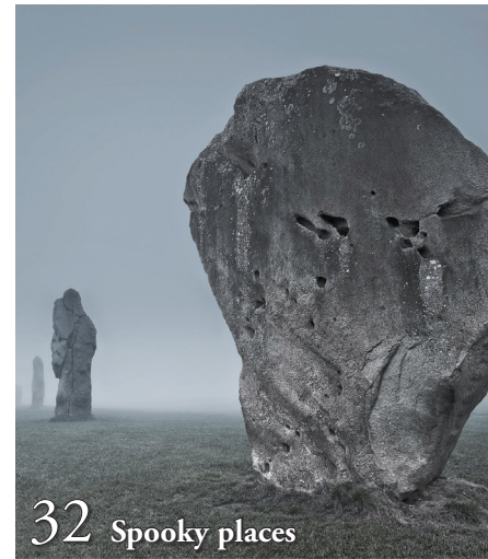
32 Spooky places