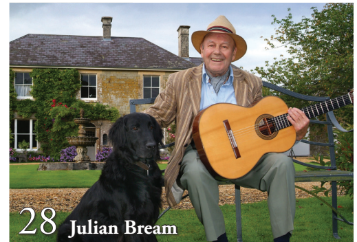
28 Julian Bream