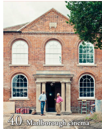
40 Marlborough cinema