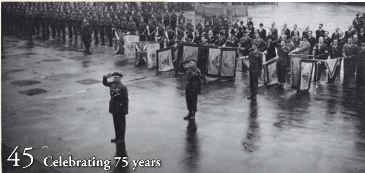
45 Celebrating 75 years