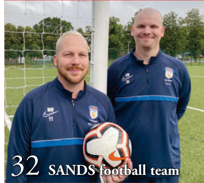
32 SANDS football team