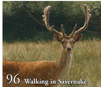
96 Walking in Savernake