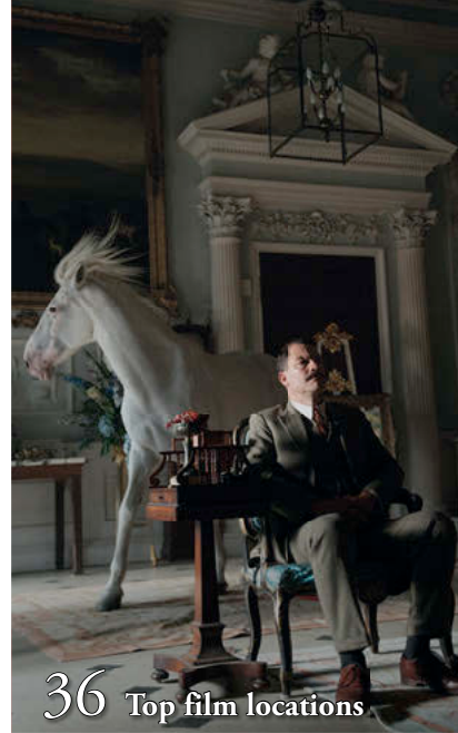
36 Top film locations