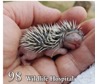
98 Wildlife Hospital