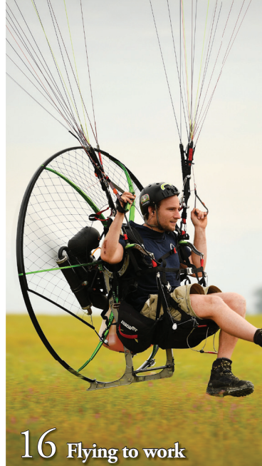
16 Flying to work