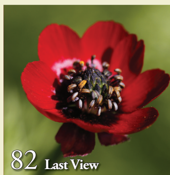
82 Last View