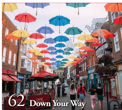
62 Down Your Way