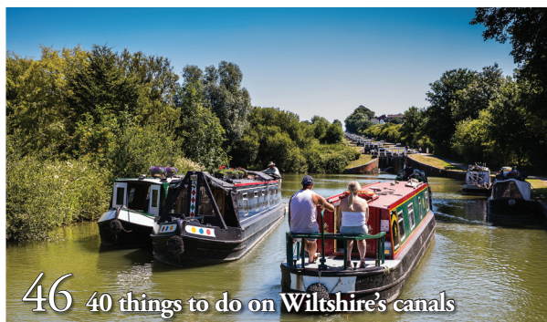
46 40 things to do on Wiltshire's canals