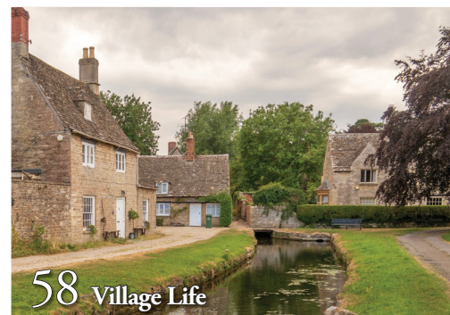
58 Village Life