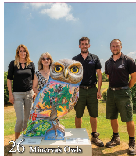
26 Minerva's Owls