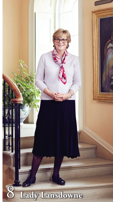
8 Lady Lansdowne