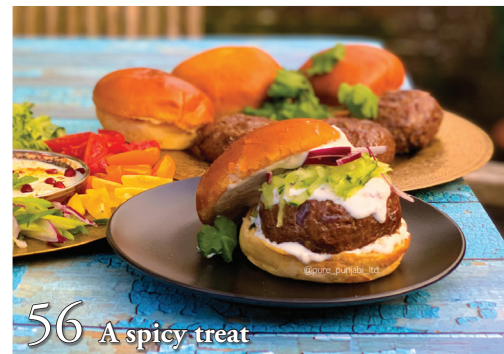
56 A spicy treat