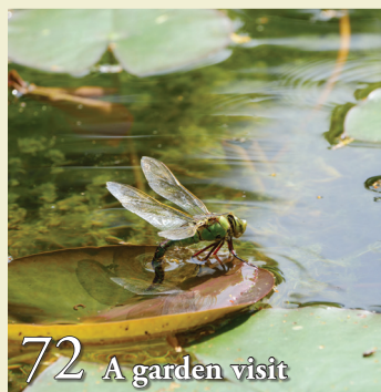
72 A garden visit