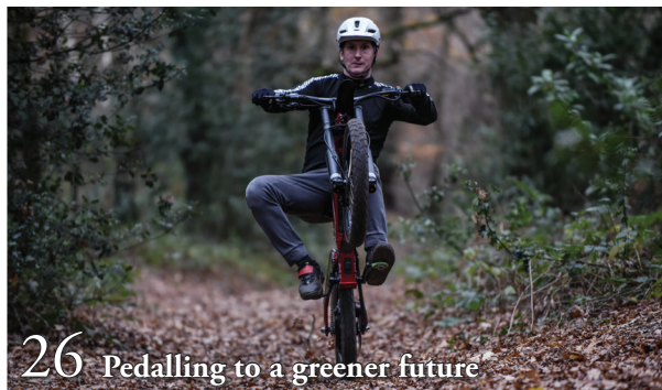
26 Pedalling to a greener future