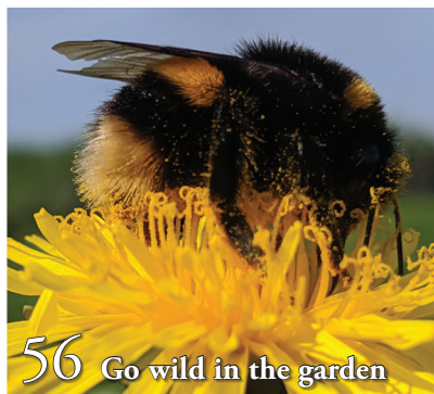
56 Go wild in the garden