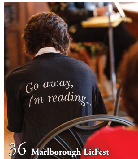
36 Marlborough LitFest