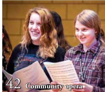
42 Community opera