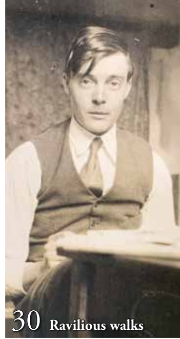
30 Ravilious walks