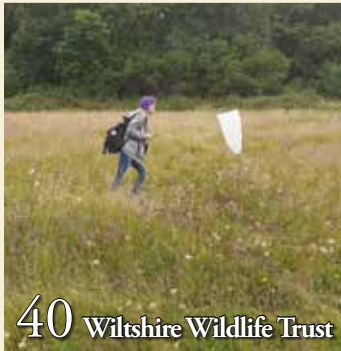
40 Wiltshire Wildlife Trust