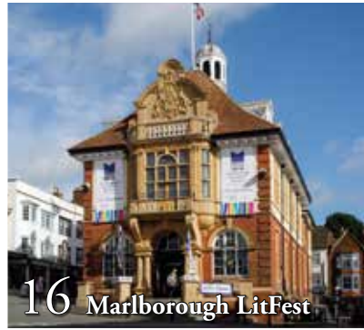
16 Marlborough LitFest